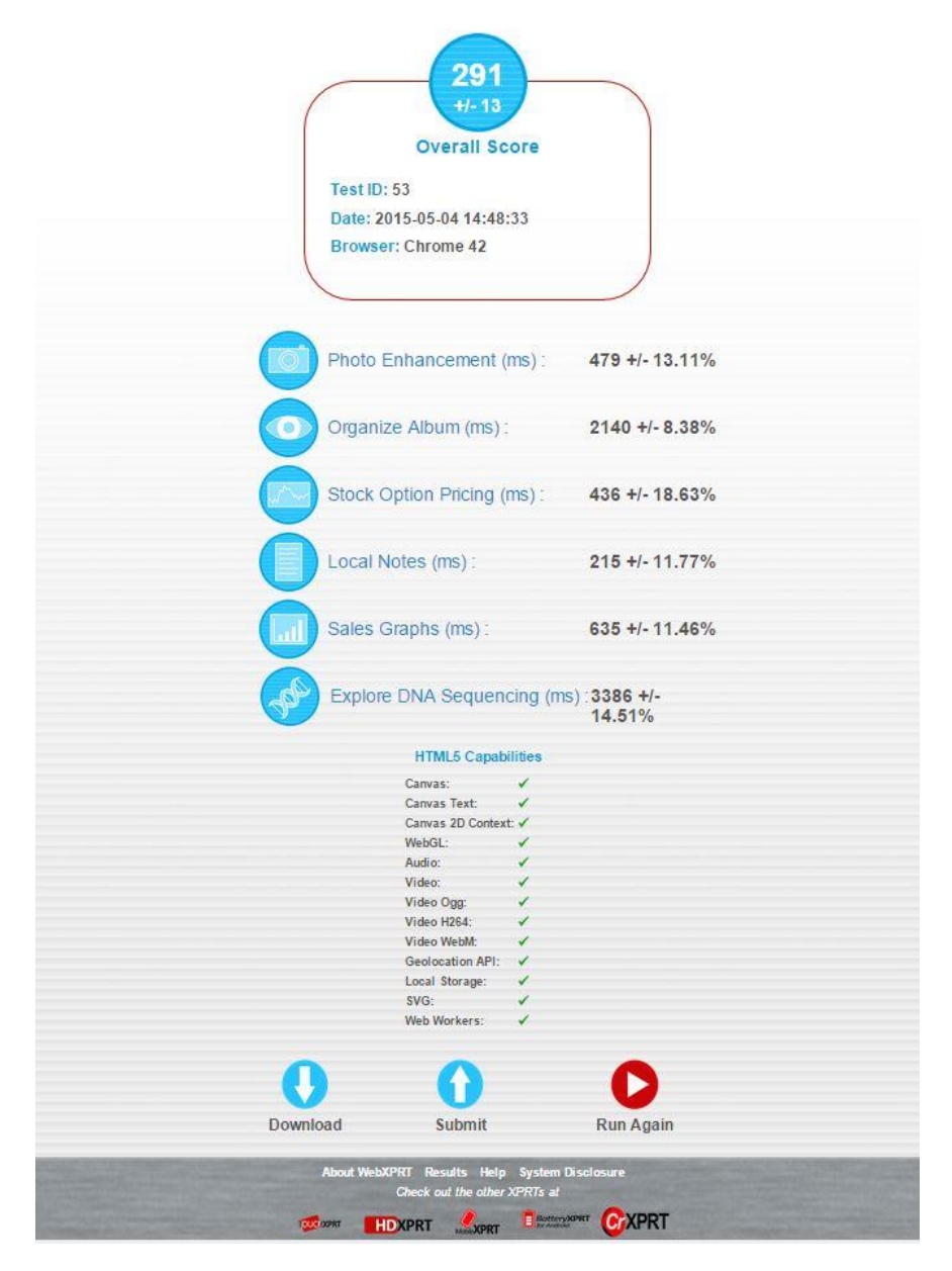
Figure 3: The WebXPRT 2015 results screen.