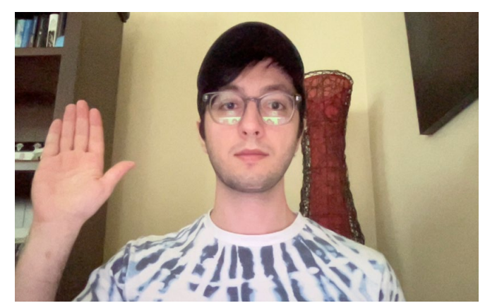
Figure 17: Unedited selfie taken in dim light on the Apple MacBook Pro (13-inch) (15.2 lux).