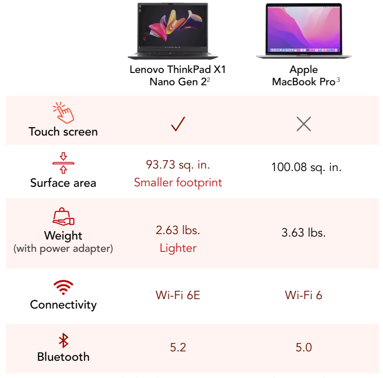
Figure 1: Lenovo ThinkPad X1 Nano Gen 2 vs. Apple MacBook Pro.

According to Lenovo, this 13-inch ultra-light (~2 lbs.) touchscreen-capable business laptop comes equipped with 12<sup>th</sup> Gen Intel Core vPro processors, a Dolby Vision™ 2K display with 2,160 x 1,350 resolution, Wi-Fi 6E capabilities, and two USB-C Thunderbolt™ 4 ports. It also contains a FHD IR camera, Dolby Atmos® speaker system, and Dolby Voice® hardware and software for an enhanced video conferencing experience. New security/privacy features include user-presence sensors that lock the device when you step away and Computer Vison, which "can auto-dim the screen when it's not in use and alert you when someone is watching over your shoulder."¹