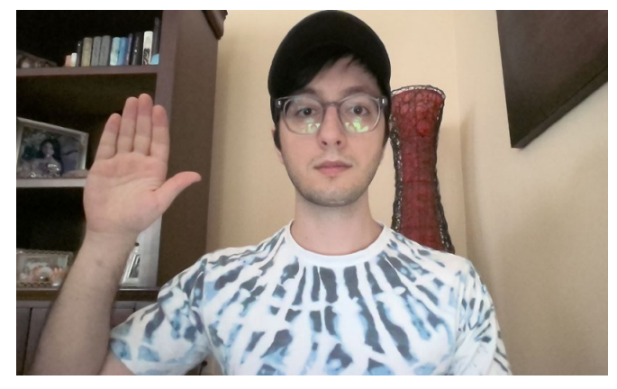
Figure 16: Unedited selfie taken in dim light on the Lenovo ThinkPad X1 Gen 2 (15.2 lux).

When teammates and clients can't be in the same room together, video calls and virtual meetings are the next best thing to being there. The ability to see facial expressions and body language goes a long way to making people feel more connected, productive, and engaged. You be the judge—which IR webcam provided the better-quality image?