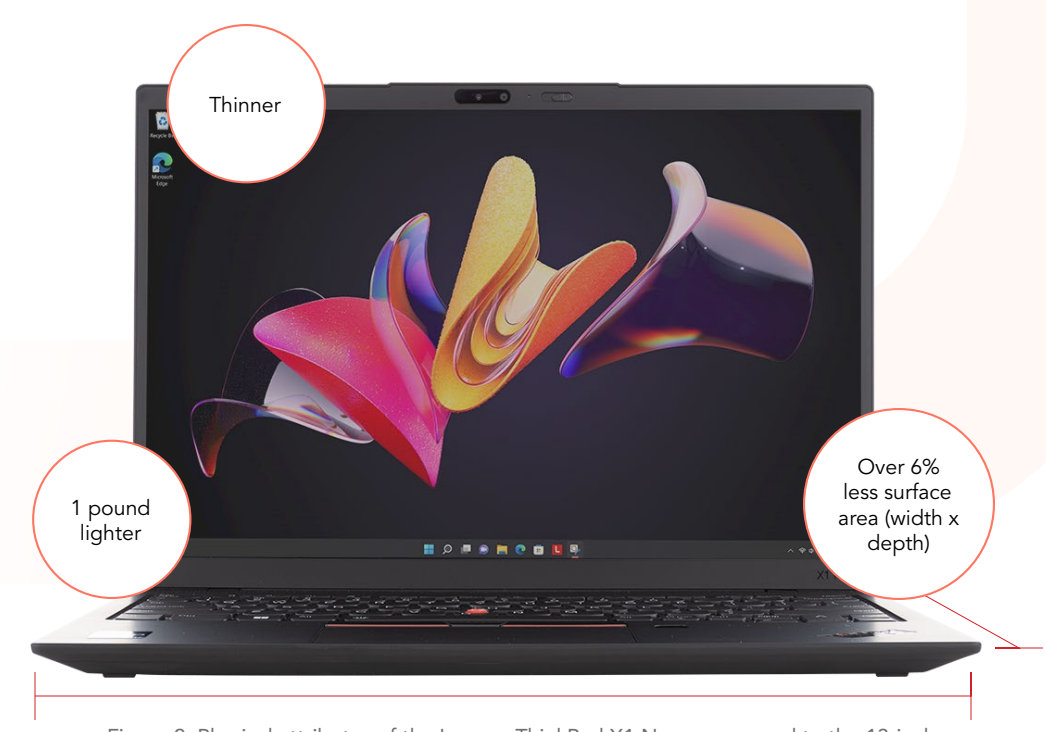
Figure 2: Physical attributes of the Lenovo ThinkPad X1 Nano compared to the 13-inch Apple MacBook Pro.

If you're lucky enough to have an at-home workstation and one that stays in the office—go you! But, before you pat yourself on the back, consider how you move from cubicle to conference room or home office to couch—do you tuck the closed laptop under your arm as you stride down the hall or do you carry it in front of you like an offering to the meeting gods? The bad posture behaviors we practice without thinking from day to day can have a negative effect on our bodies. In 2020, The Journal of the American Medical Association (JAMA) reported that insurance companies and individuals spend more on low back pain and neck pain treatments than they do on diabetes or heart disease treatments. So, be mindful when you're walking to that meeting or packing your gobag with "basic" necessities—your back (and your pocketbook) will thank you later.