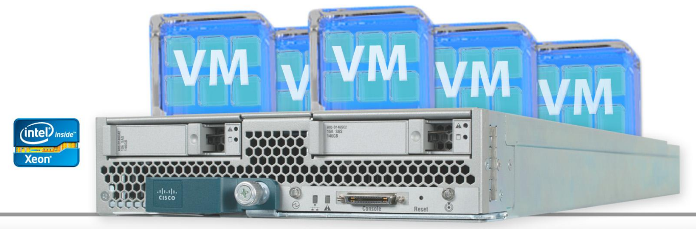
Intel Xeon processor E5-2690-based Cisco® UCS® B200 M3 Blade Server vs. AMD Opteron™ 6282 SE-based HP ProLiant DL385 G7

When selecting a server to run your database applications in virtual machines, getting the greatest performance for your investment is of paramount importance. The processors that power the servers you are considering vary dramatically in what they can deliver. The number of physical cores in a processor can be misleading—more cores do not necessarily translate to greater performance.