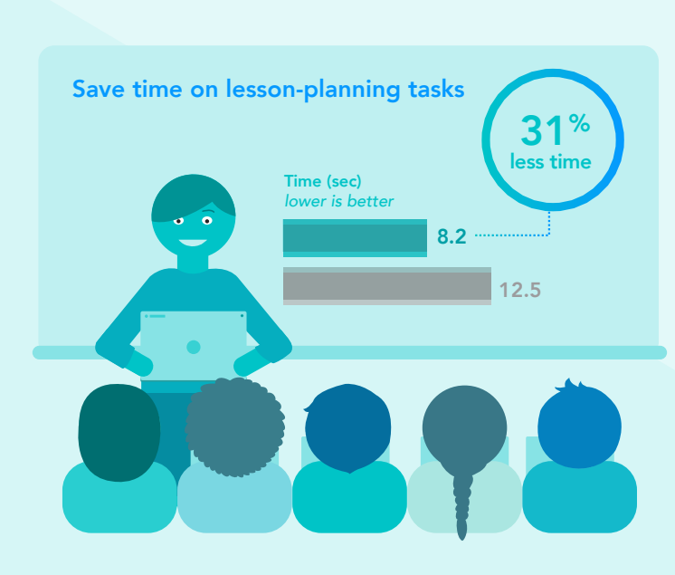
Performance means productivity

Millions of classrooms around the world use educational apps for an enhanced learning experience. For tasks in education apps that focus on lesson planning, coding, computer-aided design, and media creation, the Intel Core m3 processor-powered HP Chromebook x2 was faster than the Intel Celeron® processor-based Acer® Chromebook R 11.