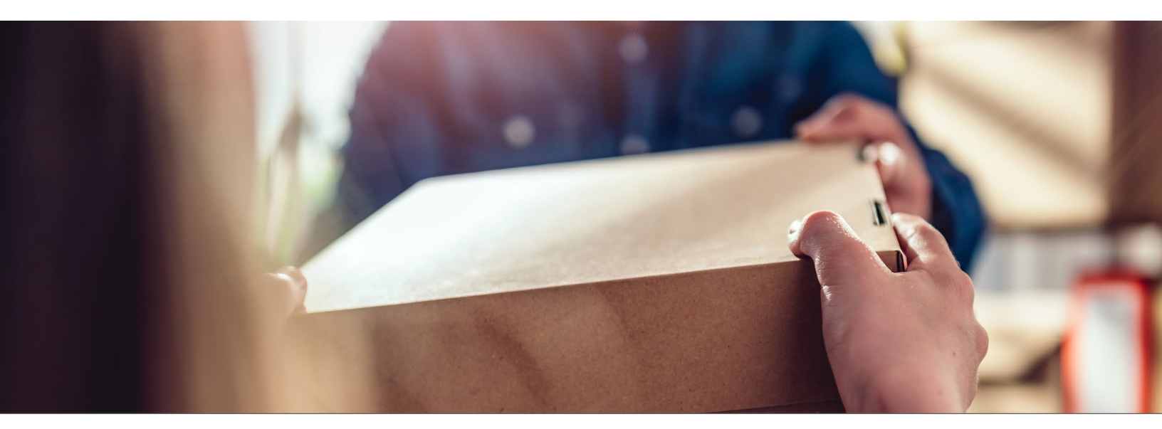
Deliver pre-configured systems to end users faster with Dell Provisioning for VMware Workspace ONE

After the second step, our administrator's work was done. Dell used the information we provided to select a Windows 10 OS image that best fit our needs, and applied that image to each system in our order with all appropriate device drivers included. Dell then applied the provisioning package and configuration file, which contained all the applications and organizational preferences we provided. We configured our deployment to use Windows Out-Of-Box Experience. We chose to connect to Microsoft Azure Active Directory (AD) instead of an on-premise AD server. We simulated the user joining the domain after receiving their laptop.