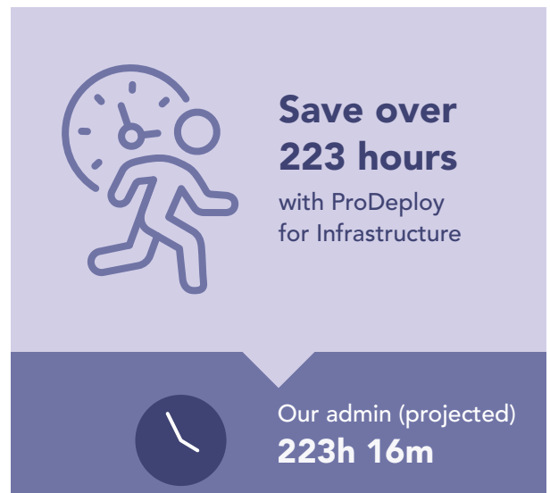
Figure 4: Extrapolated time, in hours and minutes, and steps to deploy 100 PowerEdge servers. Lower is better. Source: Principled Technologies.