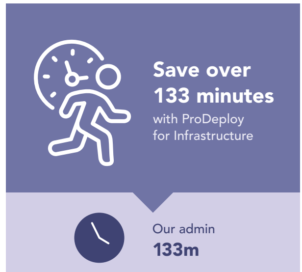
Figure 3: Time, in minutes, and steps to deploy a single PowerEdge server. Lower is better.

ProDeploy can also help with a large or multi-phase server rollout by deploying the servers for you. To show how much time an organization could save using ProDeploy for Infrastructure on a large-scale server installation, we extrapolated the captured timings from the single Dell PowerEdge R750 server deployment to 100 servers. As Figure 4 shows, allowing a Dell-certified engineer to deploy 100 PowerEdge servers for you could save over 223 hours compared to having an in-house admin deploy them.