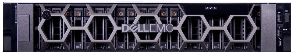
Dell EMC PowerEdge R740xd

In hands-on testing, we ran an order processing workload on a legacy Dell EMC™ PowerEdge™ R720xd server with older software, as well as the new 14th generation PowerEdge R740xd server running Microsoft® SQL Server 2017 Standard and Windows Server® 2016 Standard. The new solution significantly improved transactional database performance, processing almost seven times as many orders per minute and reducing user wait times. By upgrading your existing SQL Server environment to new Dell EMC servers and the latest software from Microsoft, you could increase transactional database performance immediately, with room for future business growth.