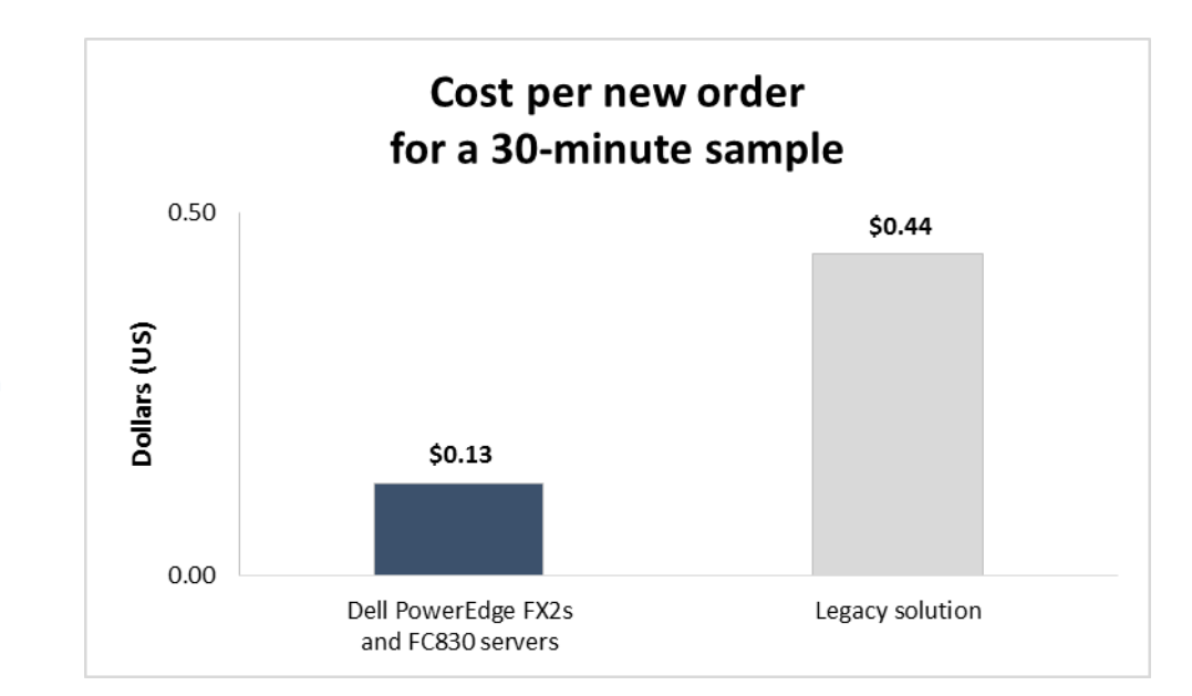
Figure 2: The Dell PowerEdge FX2s and FC830 solution delivered over 72 percent lower cost per new order than the legacy HP solution. Lower numbers are better.

Better performance is great, but lower costs can make performance benefits just that much sweeter. The Dell PowerEdge FX2s and FC830 solution can do just that. We found that the Dell PowerEdge FX2s and FC830, accounting for the acquisition cost of the hardware and the software licensing, provided 72 percent lower cost per new order compared to only the licensing cost for the existing legacy server solution. Figure 2 compares the average cost per new order for each solution, using a representative sample of 30 minutes of new orders. Although individual costs per new order would decrease over time for both solutions, the percent savings would remain the same. For more information on how we determined costs for the two solutions, see Appendix D.