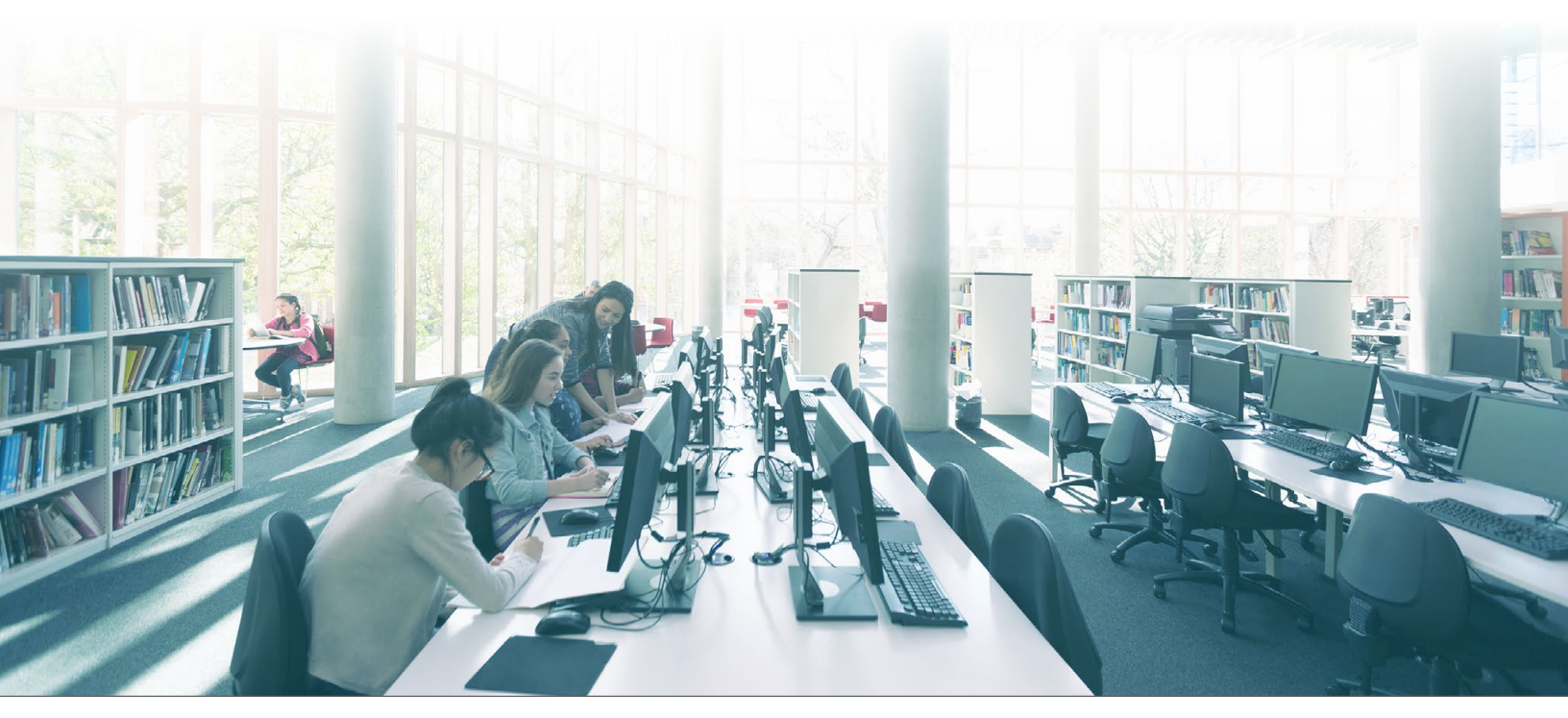
Give your VDI users the memory they need with server technology from Dell EMC and Intel

Intel Optane DC persistent memory comes in sizes of up to 512 GB, which allows a system to reach memory capacities well beyond what is possible with traditional DDR4 modules. This relieves stress on the system and facilitates fast communication between CPU and RAM, enabling more efficient use of server resources.