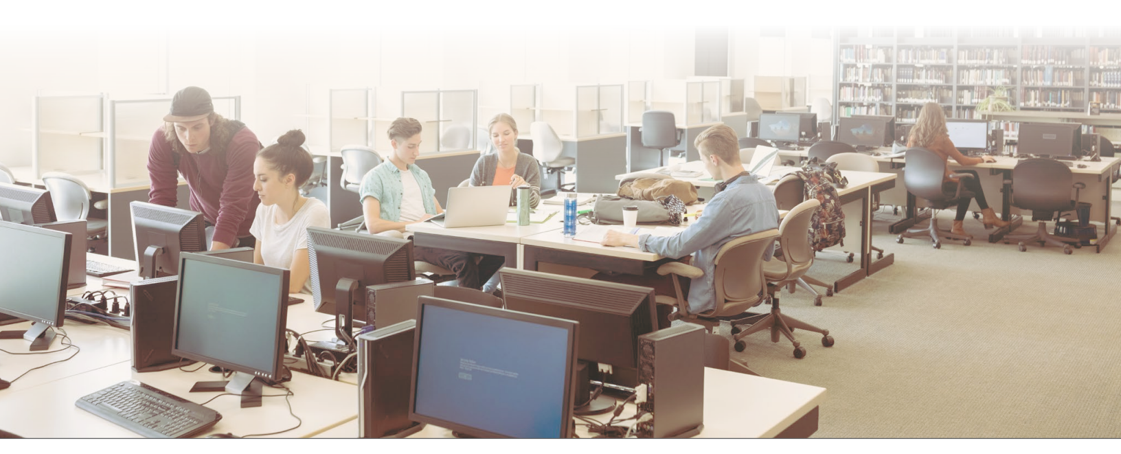
Watch your transactional database performance climb with Intel Optane DC persistent memory

To learn more about Intel Optane DC persistent memory, visit https://www.intel.com/content/www/us/en/ architecture-and-technology/optane-dc-persistent-memory.html