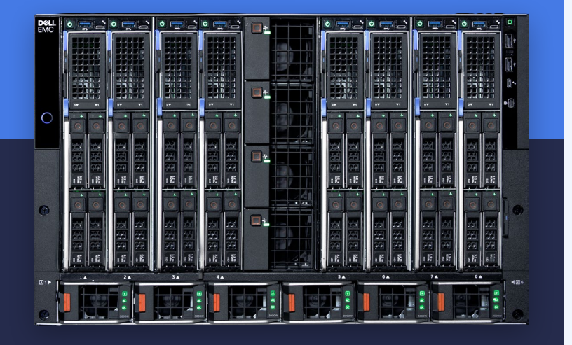
Support up to 25% more VMs with same or better performance

Achieve up to 36.1% more total OLTP work