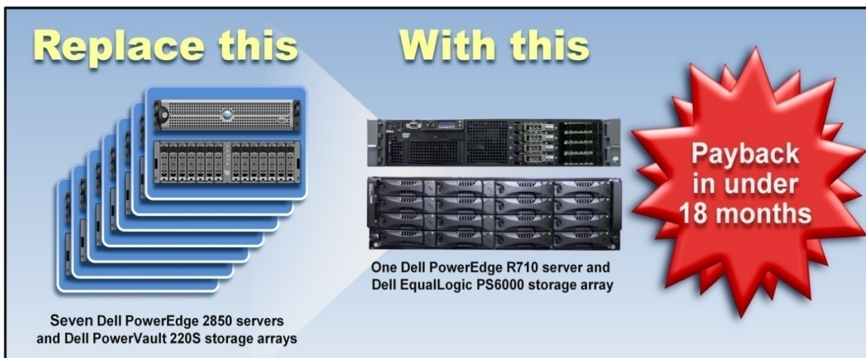
Figure 1: A single Intel Xeon Processor X5550-based Dell PowerEdge R710 solution with VMware ESX allows you to consolidate seven Intel Xeon Processor 3.6 GHz-based Dell PowerEdge 2850 solutions, with an initial investment payback period of under 18 months. We base this estimation on our specific database workload.

Our test case modeled a typical enterprise datacenter with multiple legacy Dell PowerEdge 2850 solutions running high-demand database workloads. The legacy servers each used 4 GB of memory. The enterprise in this