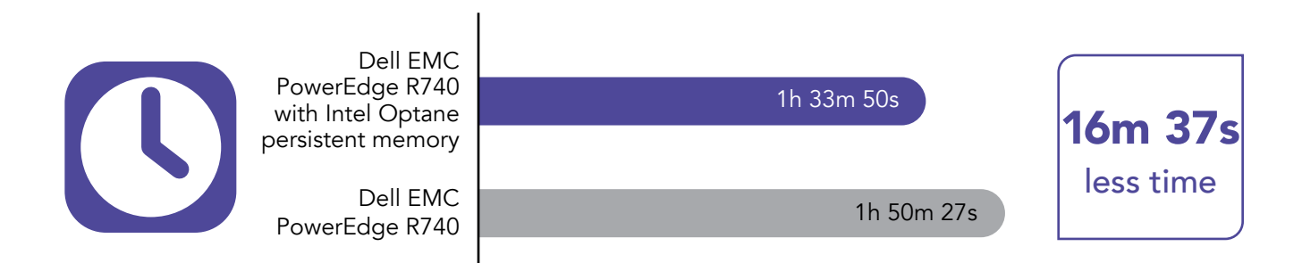
Figure 2: Average time in hours, minutes, and seconds for a query stream to complete with seven simultaneous streams running. Lower is better.

Then, we compared the data analytics performance of the Dell EMC PowerEdge R740 with and without Intel Optane PMem when running seven simultaneous query streams, as seven streams is the TPC-recommended number of simultaneous query set streams for a 1000-scale database. Simultaneous query streams each have the same number of queries as the single stream query set (22), but the orders are shuffled for each user. As Figure 2 shows, the addition of Intel Optane PMem offered an even greater performance boost on this test, improving completion time by 17.6 percent on average compared to the Dell EMC PowerEdge R740 without it. These performance advantages mean that adding Intel Optane PMem to your 2nd Generation Intel Xeon Scalable processor-powered Dell EMC PowerEdge R740 can enable you to get insight from data faster than without using PMem.