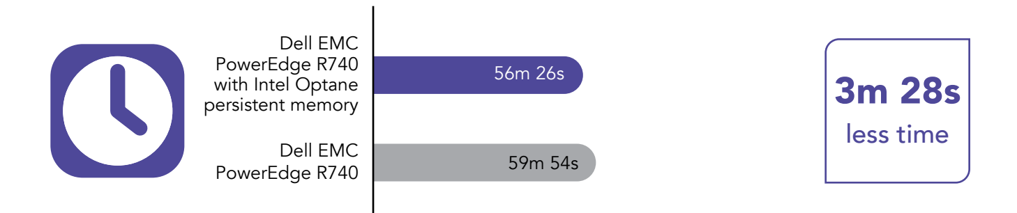
Figure 1: Time in minutes and seconds to complete a single 22-query stream. Lower is better.

First, we assessed the time it took for the Dell EMC PowerEdge R740 with and without Intel Optane PMem to complete a single 22-query stream. TPC-H comprises 22 queries that the test tool issues against the database. Each 22-query set is considered a stream; in this scenario, we executed a single stream. To test the PMem, we moved the database files from the SSDs to the PMem volumes and enabled the SQL Server Hybrid Buffer Pool feature. As Figure 1 shows, adding Intel Optane PMem to the Dell EMC PowerEdge R740 sped up the time to complete the single query stream by 6.1 percent.